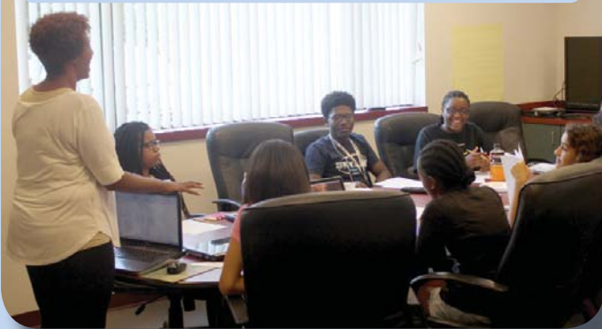
KENYA LEADS A COLLEGE PREP WORKSHOP AS A PART OF SUMMER YOUTH SERVICES